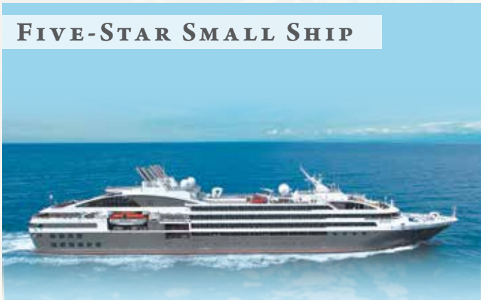
FIVE-STAR SMALL SHIP

Experience the timeless splendor of Japan and South Korea on this unique, custom-designed itinerary, featuring two nights in Kyoto and a seven-night cruise across the full length of the serene Inland Sea of Japan from Himeji, including historic ports of Japan such as Miyajima, Sakaiminato and Moji, and Ulsan, South Korea. On board the exclusively chartered, Five-Star small ship LE SOLÉAL , featuring only 110 ocean-view Suites and Staterooms, enjoy port calls at captivating points of interest, including eight UNESCO World Heritage sites. From enchanting Kyoto to storied Hiroshima, to Miyajima and the Buddhist wonders of Gyeongju, South Korea, relish in the awe-inspiring beauty of these historic ports of Japan and South Korea. Tokyo Pre-Program and Osaka and Nara Post-Program Options.