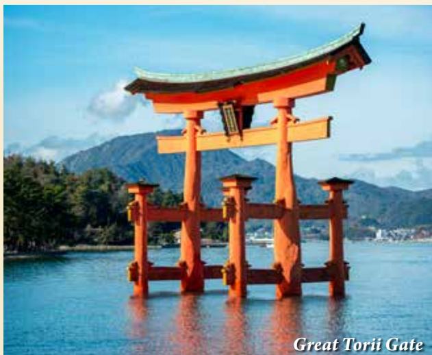
Great Torii Gate